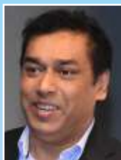
Shri Amlan Bora Trade & Investment Commissioner, Netherlands Business Support Office (NBSO), Ahmedabad